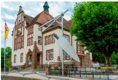
Denzlingen town hall building.