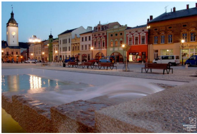
Masaryk Square in Hranice.