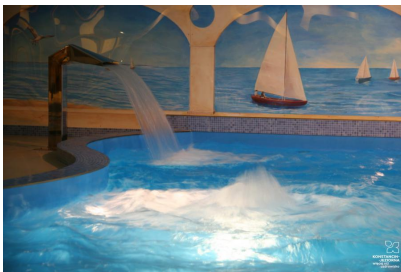
— Swimming pool at Missionary Animation Centre.

The Missionary Animation Centre [Centrum Animacji Misyjnej] has modern swimming and recreation facilities, including a recreation pool with a geyser for back, foot and neck massage; a jacuzzi bath; a dry sauna; and a steam room. Located close to the Centre are also a professionally equipped gym and massage amenities.