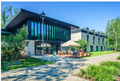
EVA Park Life & Spa Hydrotherapy Centre.

The Neurological Rehabilitation Hospital [Szpital Rehabilitacji Neurologicznej] offers comprehensive kinetic and neuropsychological rehabilitation programmes, mostly to post-stroke patients, and patients with brain traumas. The hospital specialises in the treatment of neurocognitive disorders, especially aphasia-like speech symptoms.