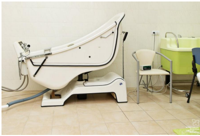
— Therapies in the Tabita Center.

The Missionary Animation Centre [Centrum Animacji Misyjnej] has modern swimming and recreation facilities, including a recreation pool with a geyser for back, foot and neck massage; a jacuzzi bath; a dry sauna; and a steam room. Located close to the Centre are also a professionally equipped gym and massage amenities.